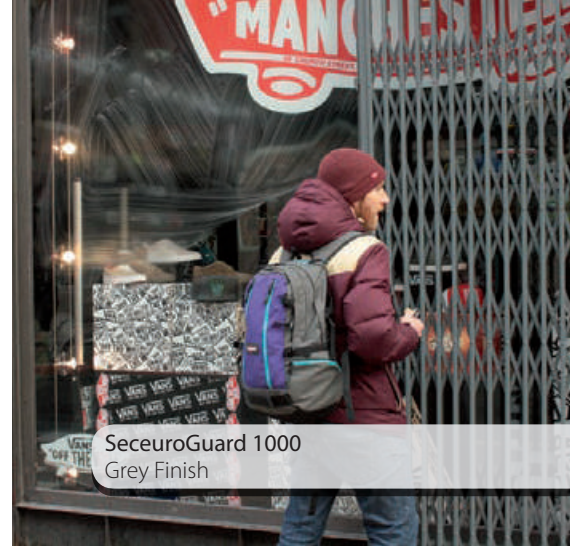
SeceuroGuard 1000 Grey Finish