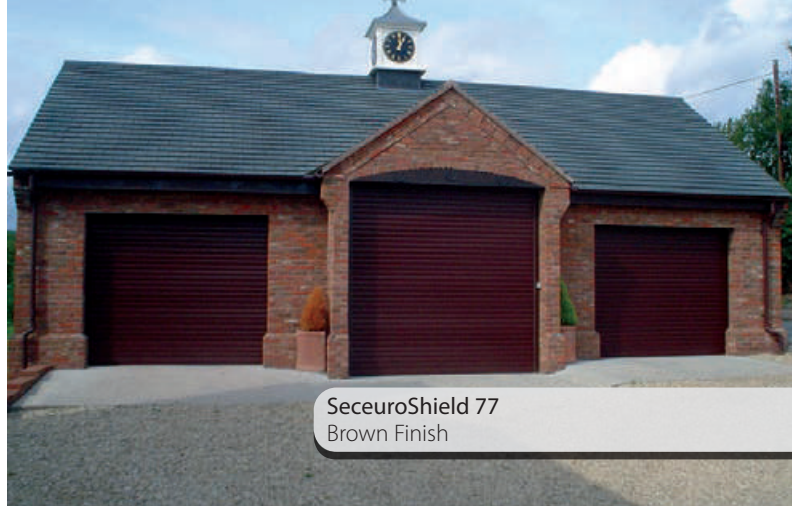
SeceuroShield 77 Brown Finish