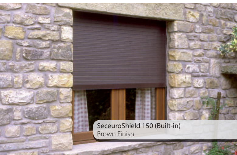
SeceuroShield 150 (Built-in) Brown Finish