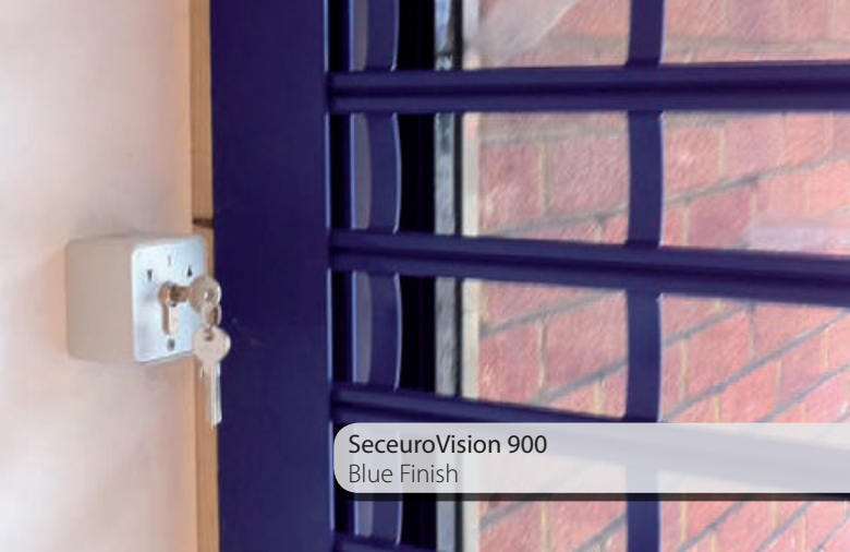
SeceuroVision 900 Blue Finish