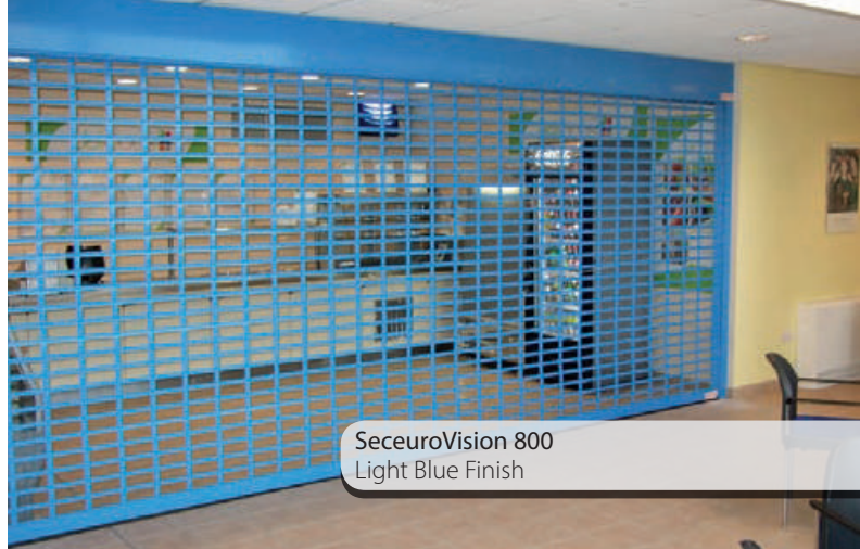
SeceuroVision 800 Light Blue Finish